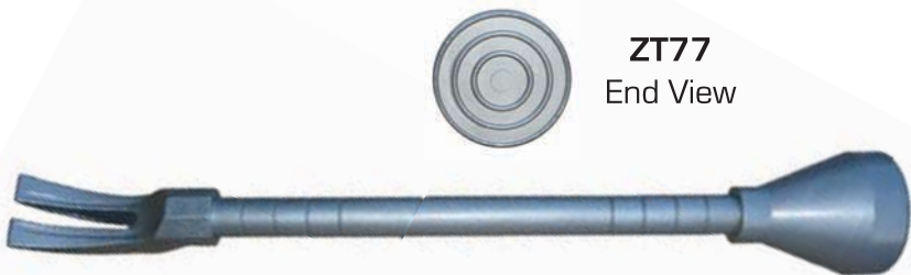
ZT77 End View

ZT77 Jam-Ram - Use the ram head for ramming and the claw head for prying door jams. Both heads are heat-treated 4130 alloy steel. Solid steel handle. One piece construction. Powder coat finish. 18 lbs. Length 28"