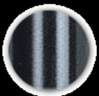
Hard Coat Anodized